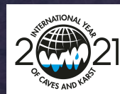
illustration Mathieu Fortinon / JAWS